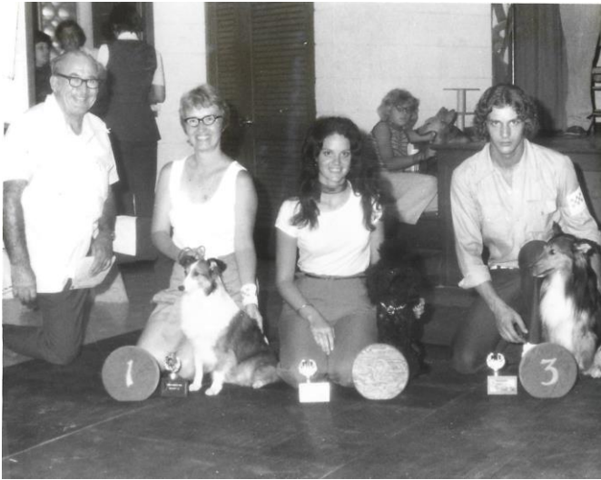
1975 DOCOF team, Dog Training Club of St. Petersburg